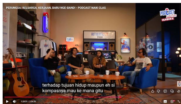
Figure 1. Podcast Interview with Perunggu

In the eighth stanza, although repeating the message from the previous section, there is a deeper meaning. At the denotative level, this stanza teaches listeners to always remember God, reflect on His provisions, and live their lives according to His guidance, so that their life journey is understood as a series of meaningful experiences. Connotatively, the use of the word “resapilah” (absorb) emphasizes that the relationship with God is not limited to mentioning His name, but requires deep contemplation and is reflected in one's daily attitudes and behavior. At the mythical level, this stanza reflects the belief that spiritual awareness plays an important role in bringing inner peace amid the complexities of life. From a transcendental communication perspective, this stanza describes the condition of an inner dialogue between humans and God, in which prayers and reflections are answered with peace, guidance, and meaning in life. This section summarizes the song with the introspection that ultimately individuals will return to reflecting on and contemplating the meaning of life through interaction with the Creator.