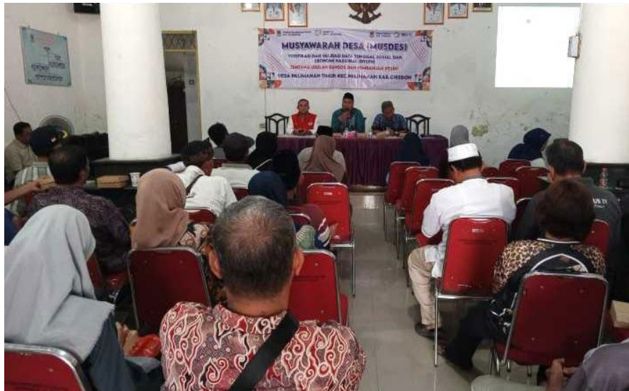
Figure 3. East Palimanan Village Meeting